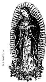
Our Lady of Guadalupe

The Annunciation of the Birth of Jesus. The Day of the Unborn Child