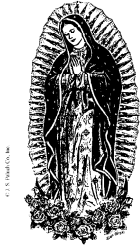
Our Lady of Guadalupe

Thursday, March 25, 2010 6:00pm—Church Featuring: RIA Music Ministry